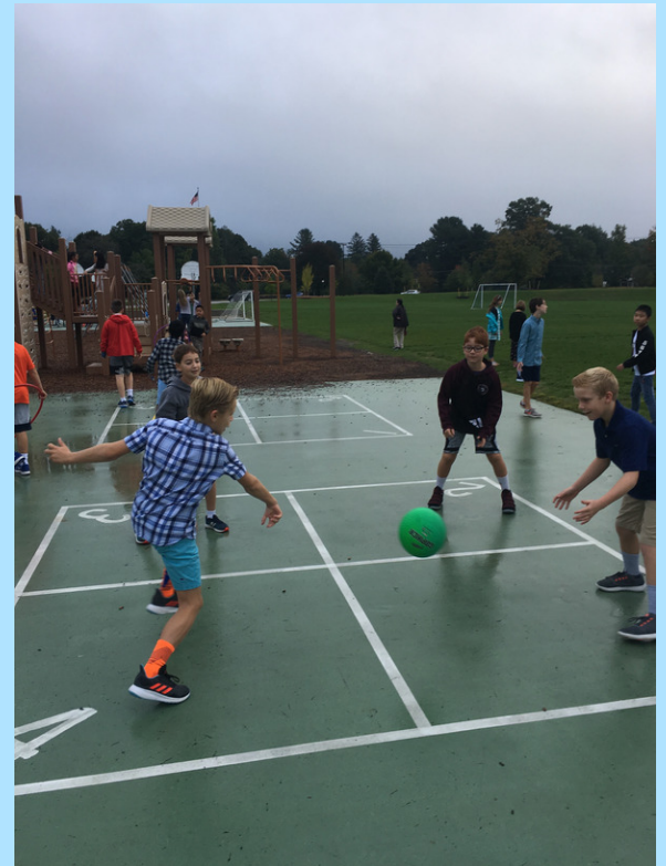
An intense game of four square at Before School Recess.