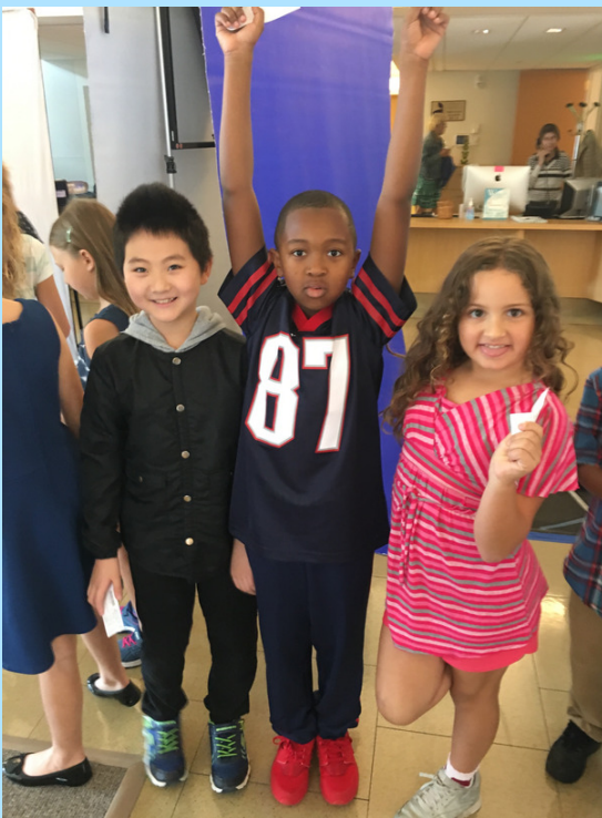
Field Picture Day was a big success!