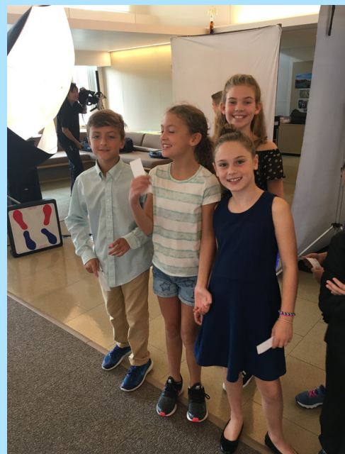
More picture day fun.