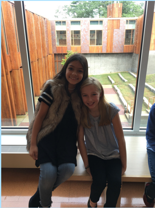
Field students enjoying a scenic spot!