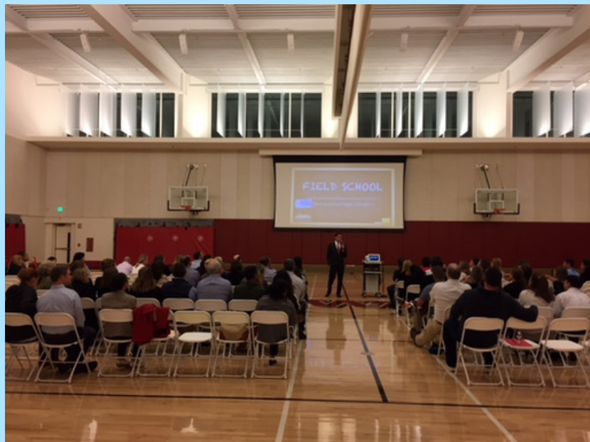
It was great seeing such a big turnout at Field BTSN!