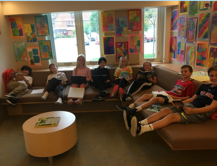
Students working in the Field front lobby.